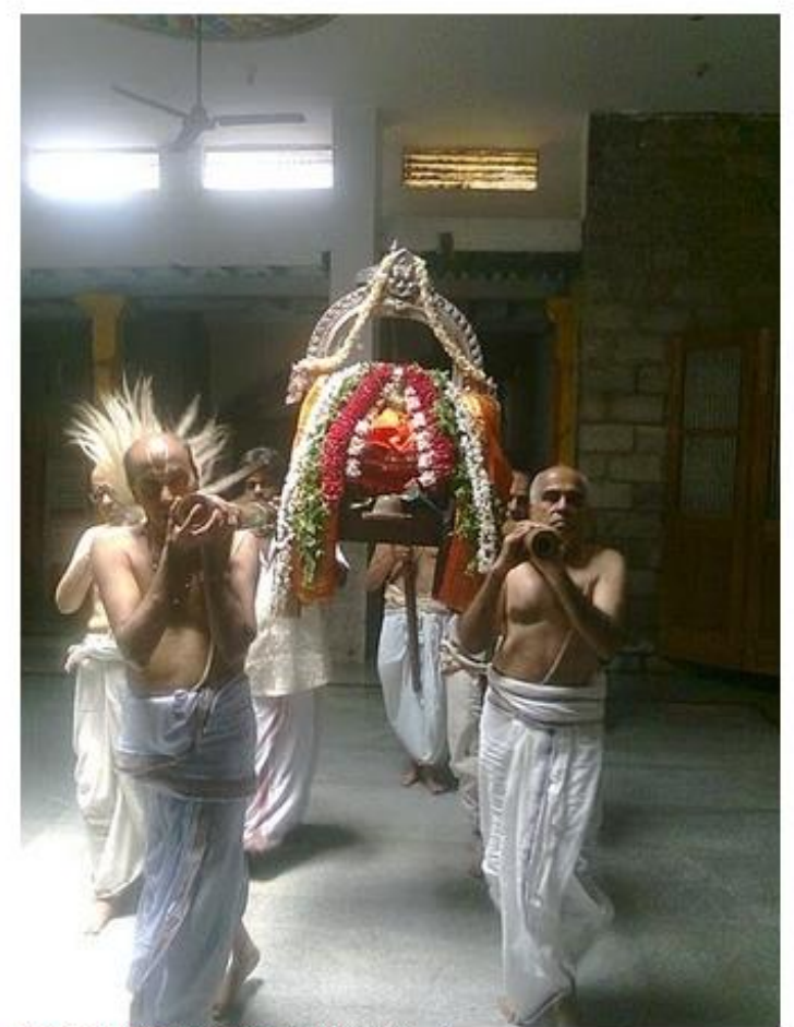
Swamy, Aradhanam, celebration at Sri <u>Prasanna Krishnaswamy</u> Temple <u>Tulasiyanam</u>, Bangalore