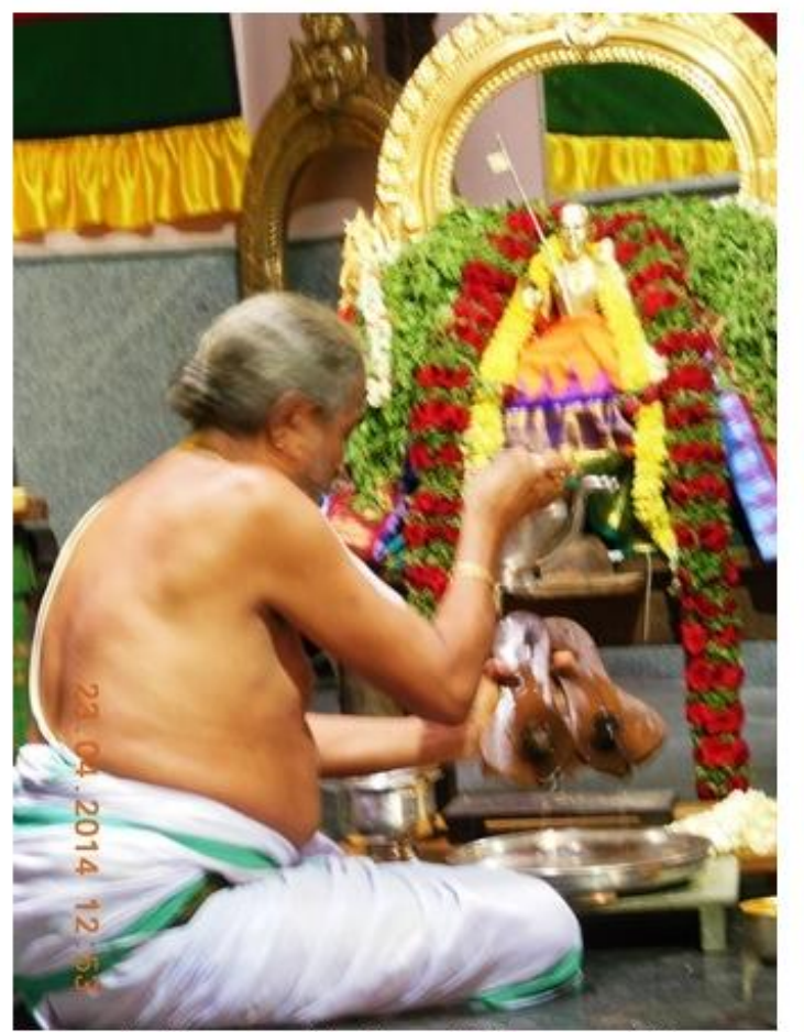
Swamy, Aradhanam, celebration at Sri Prasanna Krishnaswamy. Temple Tulasiyanam , Bangalore