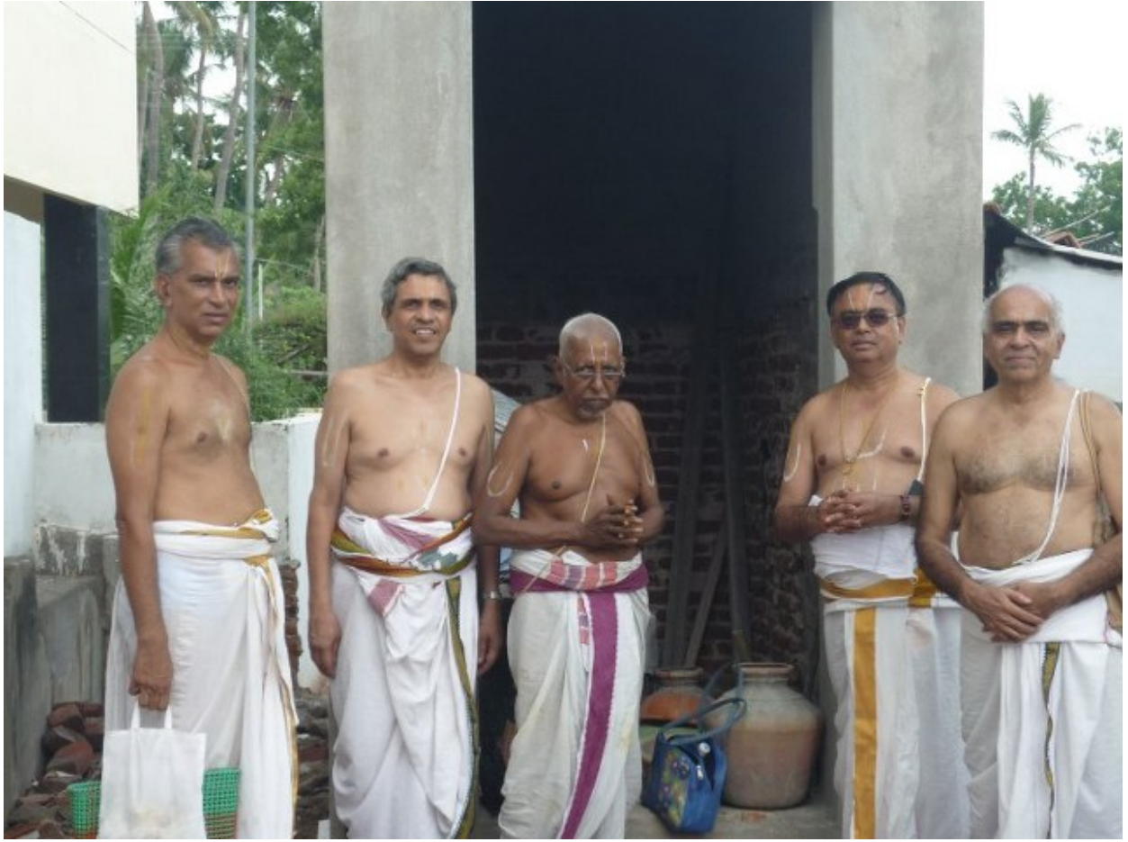
Writeup & Photography : Vyjayanthi & Sundararajan