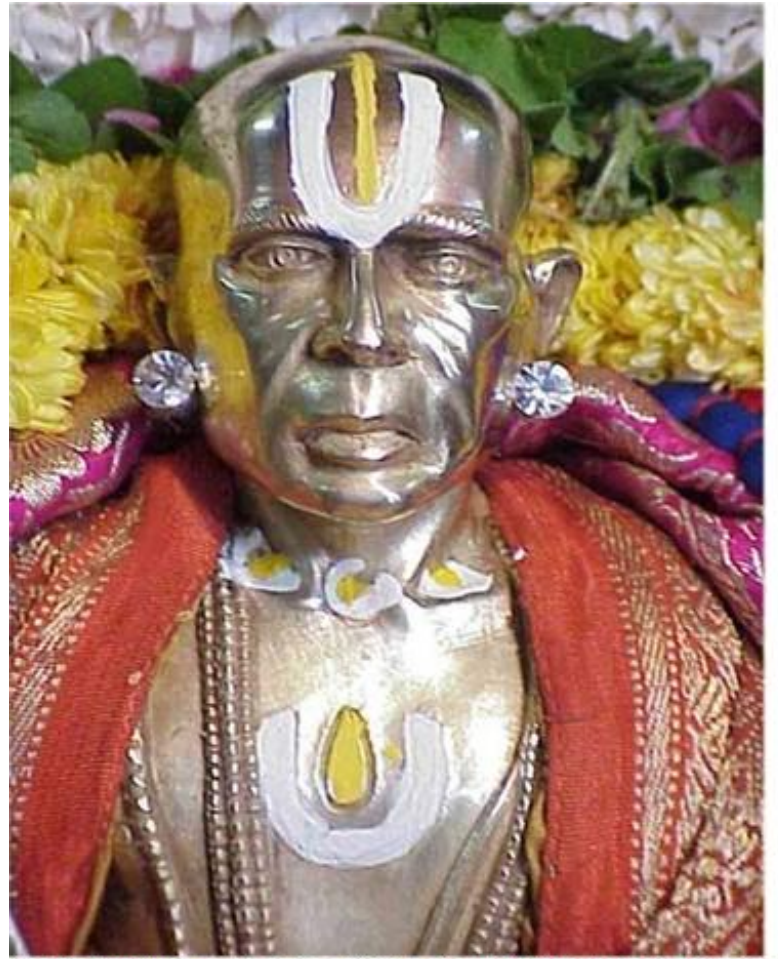
Itsava moorthy (Close up view) of Sri Thillasthanam Swamy at Sri Prasanna Krishaswamy Temple, Bangalore