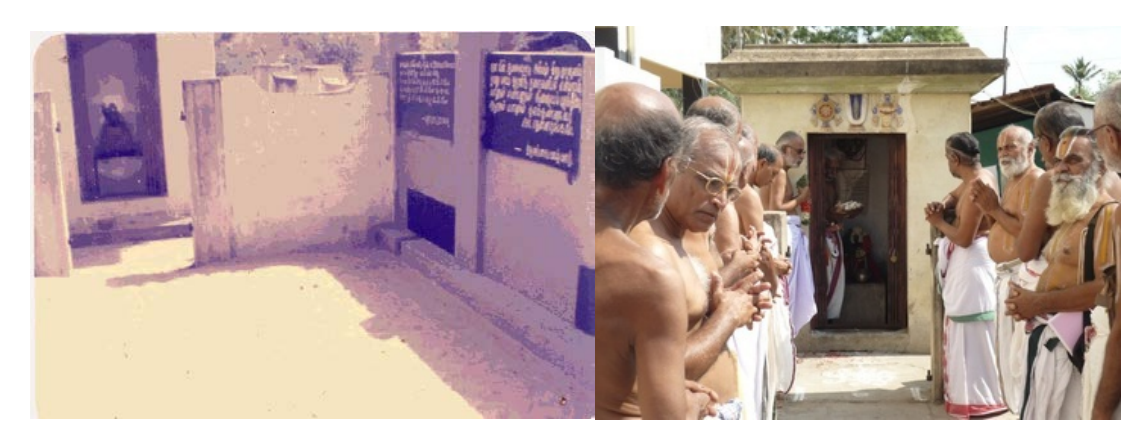
HH Sri.Swamy's Brindavanam@Srirangam with Compound wall in 1980's