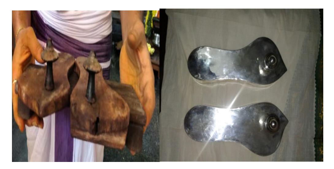
Swamy's Original Paduka with Valli Kavacha