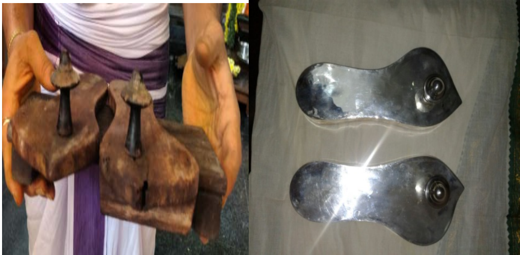
Swamy's Original Paduka with Valli Kavacha