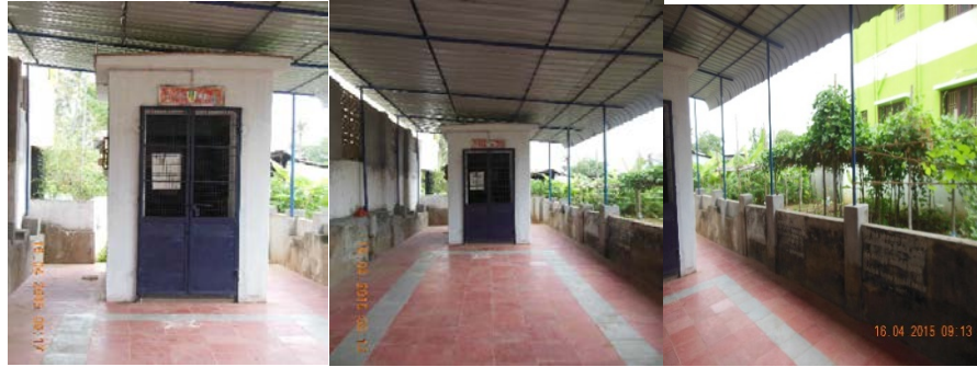
Fully renovated Swamy Brindavanam in 2015

Youtube - Video Link Swamy Brindavanam Renovation https://youtu.be/O3H0iD3DxUU