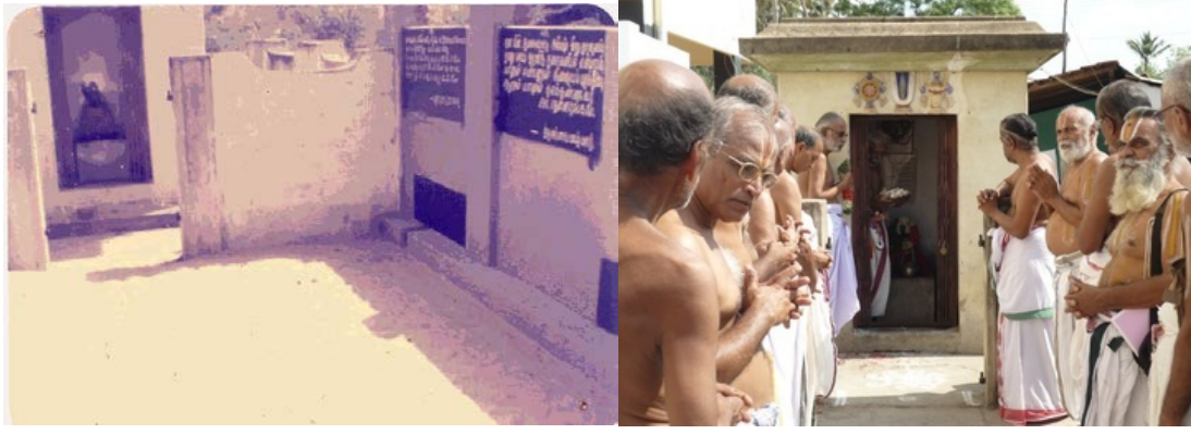
HH Sri.Swamy's Brindavanam@Srirangam with Compound wall in 1980's